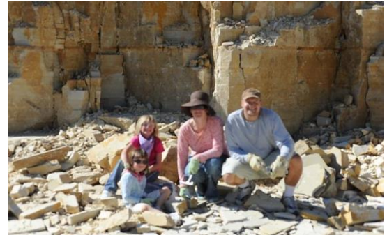
HUNTING FOR FISH FOSSILS IN WYOMING

Once I became a Mom, I planned many rockhounding trips with my children. Luckily for me, they enjoy fossil hunting too!