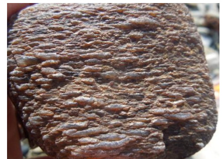
PETRIFIED WHALE BONE

We lived in California for almost 17 years and spent lots of time panning for gold, digging for geodes and searching for gems. On the beach we found petrified whale bone . Can you see how the texture of the whale bone rock is different from other rocks?